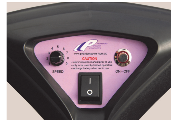
simple to use controls ensure safe easy operation for your staff