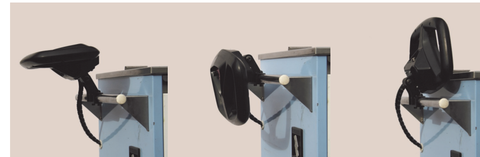
innovative handle design allows good height adjustment, compact storage as well as much reduced risk of controller damage.

please contact your local representative and they will be able to assist you in the supply and fitment of a TrolleE power drive system today.