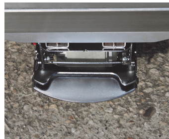
drive system easily fits to most trolley types