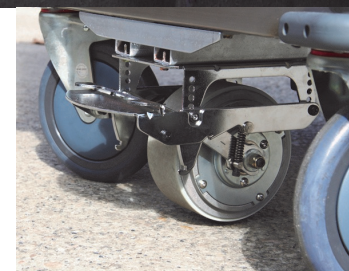
unique retractable motor mount system